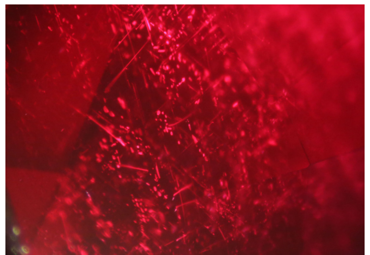
Rutile needles, platelets and particles oriented in three directions as seen in this 1.71 ct Mozambican ruby.

Some of the internal features recorded in this ruby include thick, whitish needles and flat platelets and dense 'silk' under the girdle. These inclusions are regularly observed in Mozambican and other East African rubies and are potentially helpful indicators to determine their authenticity and origin<sup>2</sup>. Further to these characteristic inclusions, small, whitish fissures under the surface are other internal features present in this 1.71 ct ruby.