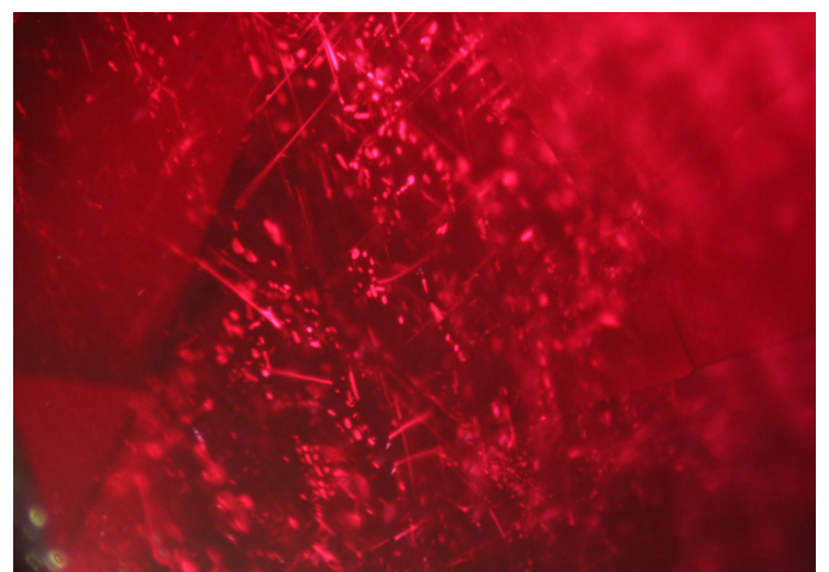
Rutile needles, platelets and particles oriented in three directions as seen in this 1.83 ct Mozambican ruby.

Some of the internal features recorded in this ruby include iridescent needles and some whitish hexagonal or irregular shaped platelets. These inclusions are regularly observed in Mozambican and other East African rubies and are potentially helpful indicators to determine their authenticity and origin<sup>2</sup>. Further to these characteristic inclusions, few whitish healed fissures are other internal features present in this 1.83 ct ruby.